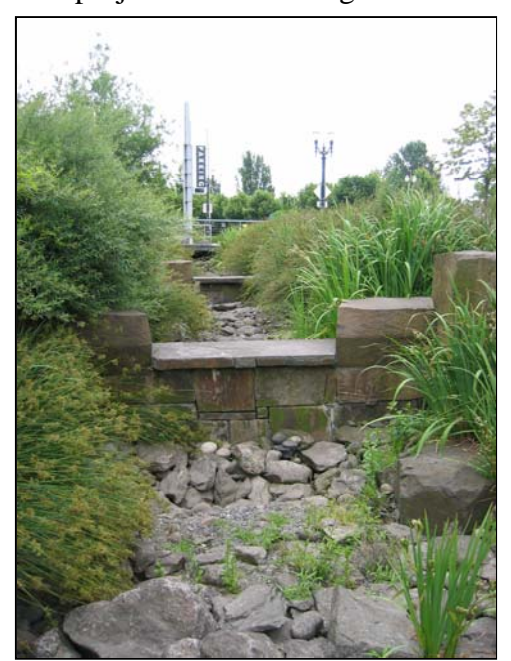
A rain garden manages runoff from impervious surfaces such as roofs and paved areas.

mentally beneficial to communities. In a few case studies, initial project costs were higher than those for conventional designs; in most cases, however, significant savings were realized due to reduced costs for site grading and preparation, stormwater infrastructure, site paving, and landscaping. Total capital cost savings ranged from 15 to 80 percent when LID methods were used, with a few exceptions in which LID project costs were higher than conventional stormwater management costs. (Table 1)