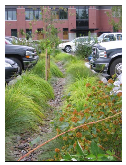
Parking lot runoff is allowed to infiltrate through a vegetated bioretention area

Low Impact Development (LID) is a stormwater management strategy that seeks to mitigate the impacts of increased runoff and stormwater pollution. LID comprises a set of site design approaches and small-scale stormwater management practices that promote the use of natural systems for infiltration, evapotranspiration, and reuse of rainwater. These practices can effectively remove nutrients, pathogens, and metals from stormwater, and they reduce the volume and intensity of stormwater flows.